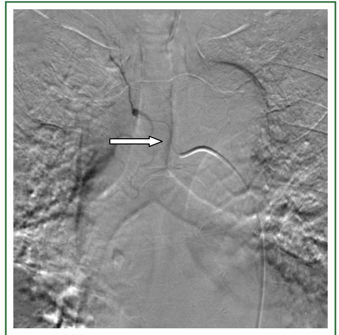
Figure 3. The ev3 Marathon microcatheter in the right bronchial artery. Under the guide of the Mirage™. 008 hydrophilic guide wire, the ev3 Marathon catheter (specialized for Onyx; hair-shaped; arrow) was inserted into the deep part of the right bronchial artery through the 5-French Cobra catheter.