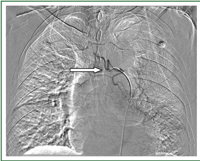
Figure 2. Failure of spring coil embolization. The 5-French Cobra catheter was stuck in the “V”-shaped crotch of left and right bronchial arteries (arrow). This catheter still could not be advanced after guidance and adjustment with a guide wire. The Cobra catheter was subsequently replaced by a 4-French Cobra catheter, 5-French RLG catheter, and conical catheter. However, these catheters could not be inserted into the deep part of the left bronchial artery; they entered the superficial part of the artery to only about 0.5 cm, and the space was not enough for release of the spring coil. We decided to abandon the spring coil embolization.