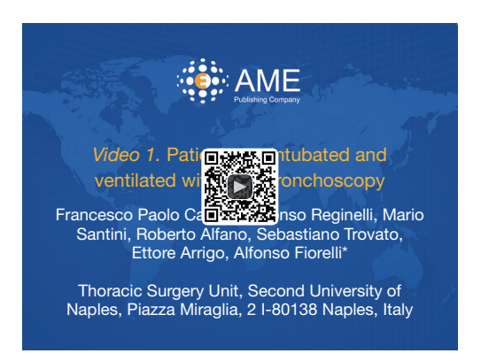
Figure 1 Patient was intubated and ventilated with rigid bronchoscopy. The tracheostomy cannula was removed and endoscopic view showed a tracheo-esophageal fistula localized 3.5 cm below the vocal folds and extended 3 cm distally. Standard 4/0 vycril needle was bent to a 90 degree angle to facilitate surgical maneuvers into a tight and angled anatomical district as trachea. The needle holder was then passed through the tracheostomy and under endoscopic view the tear was completely closed with interrupted stich. Finally, Montgomery T tube was inserted in a standard manner to protect the suture and maintain the air-way patency. Three-dimensional reconstruction of computed tomography study with an oral contrast swallow showed the complete healing of the fistula (5). Available online: http://www.asvide.com/articles/1426