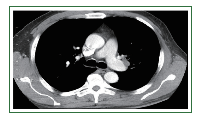
Figure 1. Computed tomography (CT) shows a mass in the left hilum.

main or lobar bronchi. So the flexible bronchoscopy is the most important diagnostic step in identifying potential candidates for sleeve procedure. Further, the tissue biopsy can also be done by bronchoscopy to defining the malignancy and to assess the tumor extension. In addition, Computed tomography (CT) as well as Magnetic resonance imaging (MRI), which provides better appreciation of lesion size, extent and location relative to thoracic structures, play a supplement role to bronchoscopy in assessing the potential candidates. In addition to anatomic location, the lymph node metastasis condition, i.e. the N factor, is another important factor for potential candidates screening. The presence of N2 does not contraindicate the sleeve procedure while impairs long term outcomes for the risk of systemic recurrences.