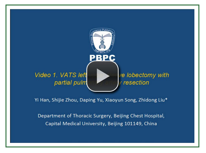
Video 1. VATS left upper sleeve lobectomy with partial pulmonary artery resection.

© Pioneer Bioscience Publishing Company. All rights reserved.