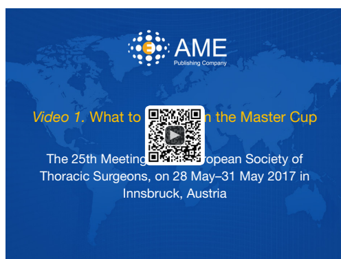
Figure 8 What to learn from the Master Cup (1). Available online: http://www.asvide.com/articles/1788