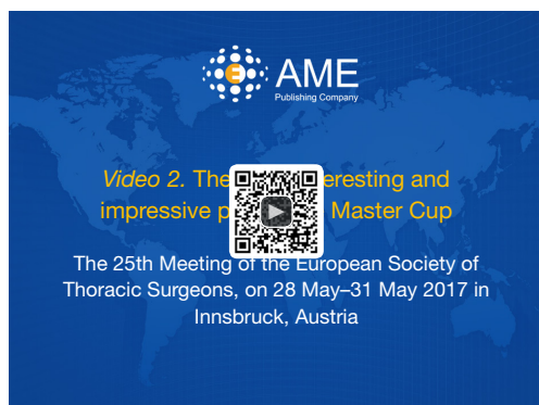
Figure 9 The most interesting and impressive part of the Master Cup (2).

What do you think is the most interesting part, and what impressed you most during the competition this year? (Figure 9)