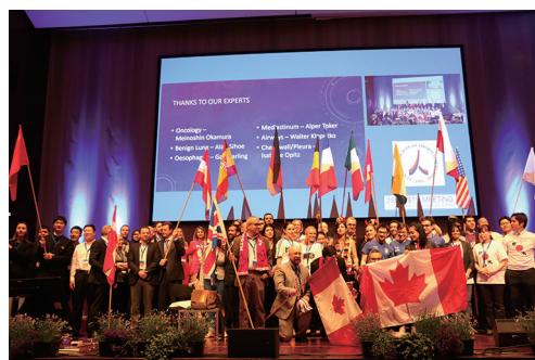
Figure 1 The postgraduate symposium-Master Cup.

After the course, we were honored to conduct brief interviews to the following team captains (Figures 2-7), and have their comments and feelings about the competition.