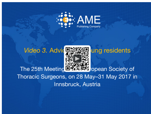
Figure 10 Advices for young residents (3).

Available online: http://www.asvide.com/articles/1790