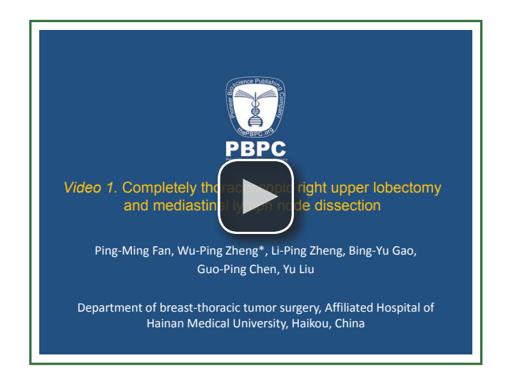
Video 1. Completely thoracoscopic right upper lobectomy and mediastinal lymph node dissection.

General anesthesia was induced via a double-lumen tube (32F)