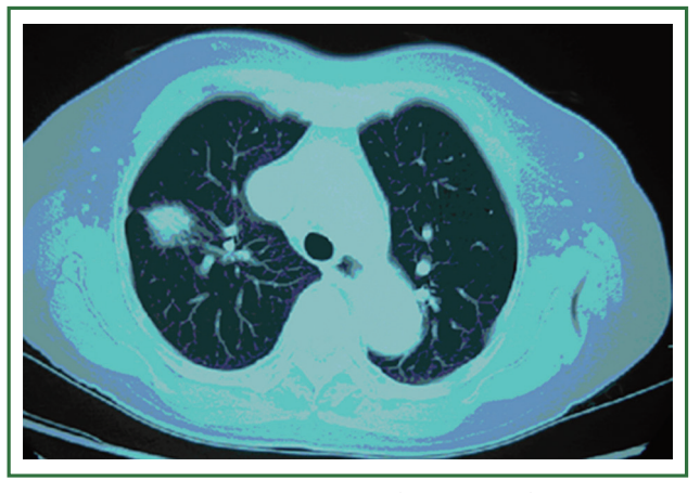
Figure 1. Tumor of the right upper lobe (lung window).