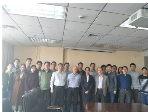
Figure 8 The thoracic surgery team at First Affiliated Hospital of Guangzhou University.