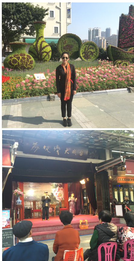
Figure 7 Exploring Guangzhou city with its elaborate and countless flower arrangements (left) and opera at the Lychee Park (right).