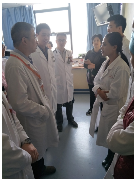
Figure 1 Morning rounds with the Dr. He and his team.