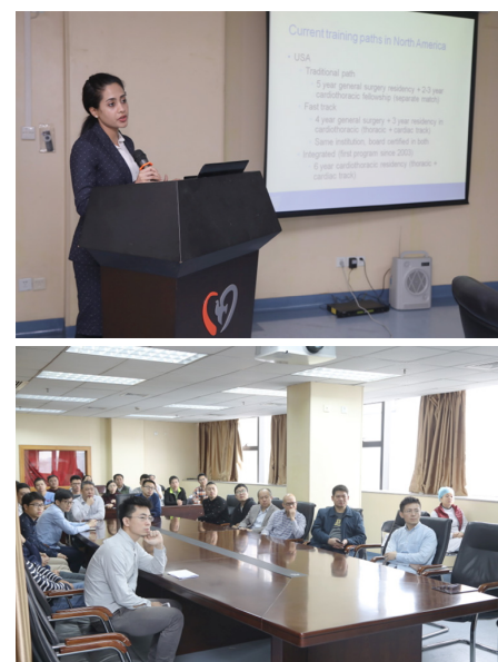
Figure 5 Presenting grand rounds on evolving paradigms in North American cardiothoracic training.

Towards the end of my visit, I had the privilege of presenting grand rounds on the evolving paradigm of cardiothoracic surgery training in North America ( Figure 5 ). During my time at Guangzhou I had the opportunity to interact with several residents in various stages of training and it was interesting to note the similarities in the challenges of surgical training including longer training times (due to the need for multiple fellowships). The presentation provided a platform to discuss strategies to overcome these issues including the growth of simulation training, competency-based education and novel models of instruction and assessment. I enjoyed interacting with the keen medical students, bright residents