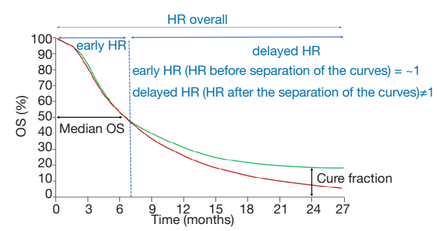
Figure 1 Hypothetical survival curves of an immune checkpoint inhibitor (green line) associated with a long-term benefit compared to a standard non-immunotherapeutic agent (i.e., cytotoxic chemotherapy) (red line).