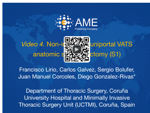
Figure 7 Non-intubated uniportal VATS anatomic segmentectomy (S1) (34). VATS, video-assisted thoracic surgery.

Available online: http://www.asvide.com/article/view/26493