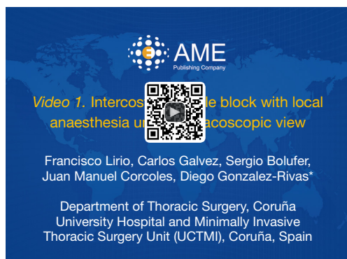
Figure 1 Intercostal multiple block with local anaesthesia under thoracoscopic view (30).

DLCO, diffusing capacity of the lung for carbon monoxide; BMI, body mass index; FEV1, forced expiratory volume in the first second; ASA, American Society of Anesthesiology.