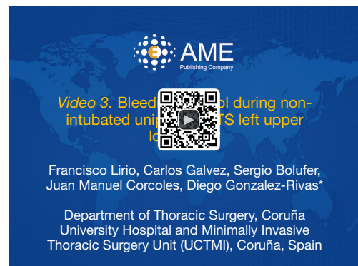
Figure 6 Bleeding control during non-intubated uniportal VATS left upper lobectomy (32). VATS, video-assisted thoracic surgery. Available online: http://www.asvide.com/article/view/26492

If elective or urgent conversion to general anaesthesia is required (Table 2), the surgical team must be familiar with the crisis management protocol and have an effective communication (23). Emergency equipment must always be ready and the anaesthetist must be trained in lateral