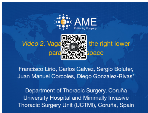
Figure 4 Vagal block in the right lower paratracheal space (31). Available online: http://www.asvide.com/article/view/26490