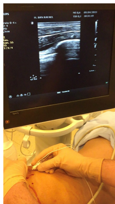
Figure 2 Paravertebral block under ultrasound guidance.

be used for analgesia in non-intubated procedures as long as are combined with sedation. Intercostal block has been reported to offer a significant reduction of induction time and less need of vasoactive drugs (29). A mixture of lidocaine 1% and levobupivacaine 0.2% is used to block the level of the incision and can be extended two or three intercostal spaces above and below. This procedure should be done