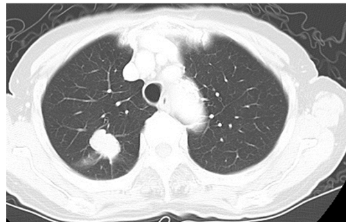
Figure 1 Chest computed tomography (CT) at the time when the patient was referred to our hospital. CT showed a solitary 2.2 cm lung nodule in the right upper lobe.

A 73-year-old female non-smoker was referred to our hospital due to growing lung tumors despite gefitinib treatment. Seven years before admission, she received gefitinib treatment for lung adenocarcinoma in the right upper lobe with multiple lung metastases harboring EGFR mutations including exon 19 deletion and exon 21 L858R (clinical stage IV, TMN classification seventh edition) (9). Following gefitinib treatment, she had achieved a partial response for 6 years. However, at the time she was referred to our institution, chest computed tomography (CT) showed the regrowth of a solitary 2.2 cm lung nodule and