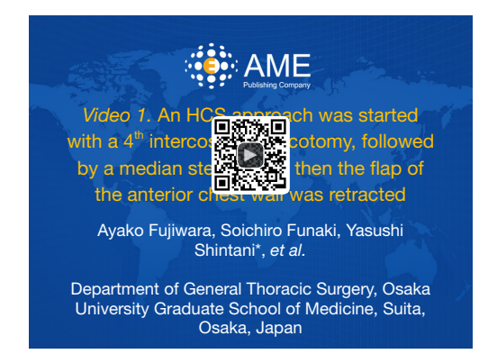
Figure S1 An HCS approach was started with a 4<sup>th</sup> intercostal thoracotomy, followed by a median sternotomy, then the flap of the anterior chest wall was retracted (17). HCS, hemi-clamshell. Available online: http://www.asvide.com/article/view/29195