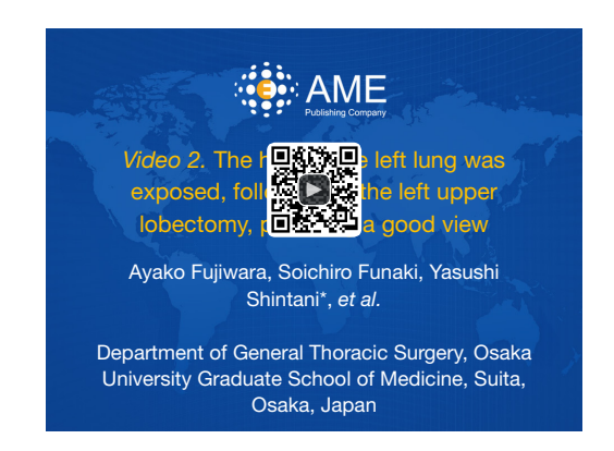
Figure S2 The hilar of the left lung was exposed, followed by the left upper lobectomy, providing a good view (18). Available online: http://www.asvide.com/article/view/29196

17. Fujiwara A, Funaki S, Ose N, et al. An HCS approach was started with a 4th intercostal thoracotomy, followed by a median sternotomy, then the flap of the anterior chest wall was retracted. Asvide 2018;5:933. Available online: http://