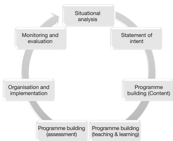
Figure 1 The situational model (7).

standardisation of training across Europe by setting the standards for all aspects of training, free movement of trainees across centres and nations, as well as the delivery of the best care to patients with respiratory diseases.