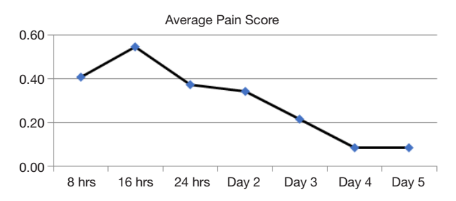
Figure 3 The average pain score over the first 24 hours and subsequently over the next 4 days.

were 0.44, 0.55 and 0.37 ( Figure 3 ). The average pain score on day 2, 3, 4 and 5 post operatively were 0.34, 0.21, and 0.09 and 0.08, respectively.