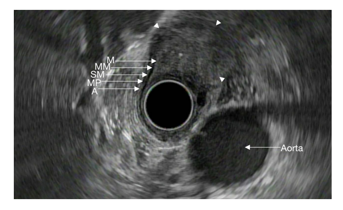
Figure 1 Endosonographic image revealing the five layers of the esophageal wall: mucosa (M), muscularis mucosa (MM), submucosa (SM), muscularis propria (MP), and adventitia (A). A transmural mass is visualized invading the adventitia (borders marked by arrowheads). This lesion was staged as T3N0.

a combination of endoscopic ultrasonography and crosssectional imaging, as will be discussed.