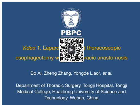
Figure S1 Laparoscopic and thoracoscopic esophagectomy with intrathoracic anastomosis (12): (I) laparoscopic mobilization of the stomach; (II) thoracoscopic mobilization of thoracic segment of esophagus and tumor; (III) purse-string suture and insertion of the stapler anvil; (IV) intrathoracic anastomosis; (V) tension-relieving suture of the anastomotic stoma, embedded with pedicled omental flap. Available online: http://www.asvide.com/articles/282