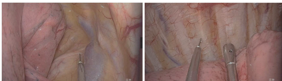
Figure 1 Thoracoscopic vagus nerve block and internal intercostal nerve block.

previously (7,8). Briefly, a three-port method was used to perform thoracoscopic surgery, and the observation port was located between the 6 th and 8 th intercostal. The auxiliary port and the operation port were located at the same area between the 4 th and 5 th intercostal cartilages. The observation port marked the starting point for opening the chest. A 1-cm 30° thoracoscope was used for visualization, and under direct thoracoscopic vision, 5 mL of 1% lidocaine and 0.375% ropivacaine mixture was injected into the trunk surrounding the vagus nerve ( Figure 1 ). After the surgery, the pleural cavity was closed, the wound was sutured, and the intravenous anesthetic was stopped. The patient was sent to the post-anesthesia care unit (PACU). When the patient was conscious and the deglutition reflex was restored, the LMA was removed. One hour after the patient showed full recovery from the anesthesia, the visual analog scale (VAS) (scores 0= no pain to 10= unbearable pain) was used to assess the degree of pain.