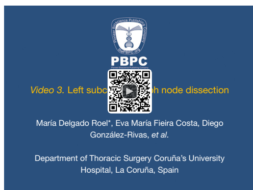
Figure 3 Left subcarinal lymph node dissection (7). Available online: http://www.asvide.com/articles/338