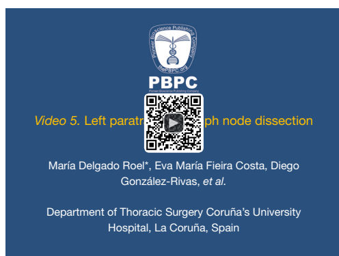
Figure 5 Left paratracheal lymph node dissection (9). Available online: http://www.asvide.com/articles/340

exposes the subcarinal space and the anti-trendelenburg position which exposes the paratracheal area.