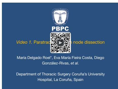
Figure 1 Paratracheal lymph node dissection (5).

Available online: http://www.asvide.com/articles/336