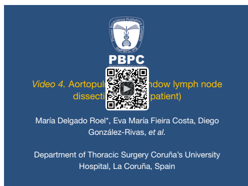
Figure 4 Aortopulmonary window lymph node dissection (awake patient) (8). Available online: http://www.asvide.com/articles/339