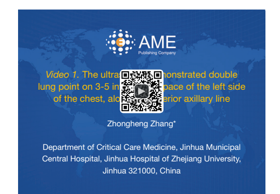
Figure 3 The ultrasound demonstrated double lung point on 3-5 intercostal space of the left side of the chest, along the anterior axillary line (4). Available online: http://www.asvide.com/articles/467

Due to the rapid respiratory rate despite mechanical ventilation, vecuronium was used for muscular relaxation. Analgesia and sedation were routinely instituted. Because there was pneumothorax found in CT scan and high inspiratory pressure, the extension of the pneumothorax should be suspected. Repeated portable ultrasonography was performed by experienced intensivist. The patient was assumed a supine position and the examination was started by scanning the anterior chest with a 7.5 MHZ probe (M-turbo, Sonosite, Washington, USA) (Figure 3). As shown in the video, there were two lung points on both sides of the screen. Between these two points, there was no lung sliding or B-line suggesting separation of visceral and parietal pleura. Laterally to the points, the pleural sliding and B-line sign were evident. Both lung points moved simultaneously with respiration.