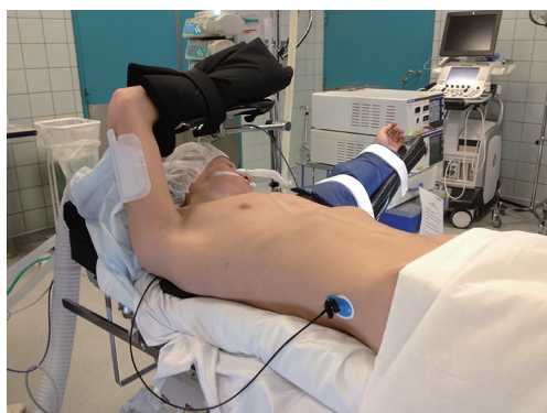
Figure 1 Patient position on the table.