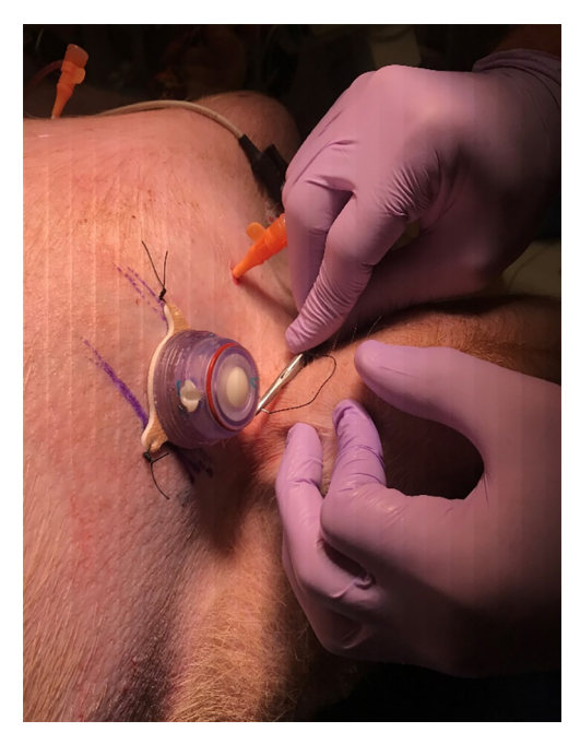
Figure 1 Securing PPTS port after insertion (prior to attachment connection). PPTS, PleuraPath<sup>TM</sup> Thoracostomy System.

the side with control device insertion, a traditional 36-Fr chest tube (Teleflex, USA) was used and secured in standard fashion (i.e., shoelace suture, occlusive gauze, gauze, tape). For the PPTS intervention side, a PPTS port with chest tube attachment (36 Fr) was placed and secured via the device's adhesive backing and suture-eyelets ( Figure 1 ). Both the traditional and PPTS chest tubes were then connected to individual dry-suction suction apparatuses (Ocean 2050, Atrium), with the suction off and tubes clamped to prevent drainage ( Figure 2 ).