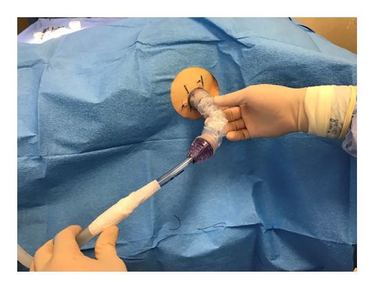
Figure 2 PPTS chest tube inserted into a swine and connected to suction. PPTS, PleuraPath™ Thoracostomy System.

Bilateral thoracic access was then additionally obtained using the Seldinger technique and 7-Fr introduction catheters in the 3<sup>rd</sup> intercostal spaces at the anterior-axillary line and their position in the thoracic cavity confirmed via air aspiration. Subsequent to catheter placement, 1 L of native blood was withdrawn simultaneously from both carotid artery lines and infused into their respective pleural cavities at a rate of 50 mL per minute per side, for a total of 2 L bilaterally over 20 minutes. After 15 minutes of controlled hemorrhage and induction of hemothorax, 3 L of 5% Dextrose in Lactated Ringer's (Baxter, Deerfield, IL, USA) was given via bolus to prevent cardiovascular collapse.