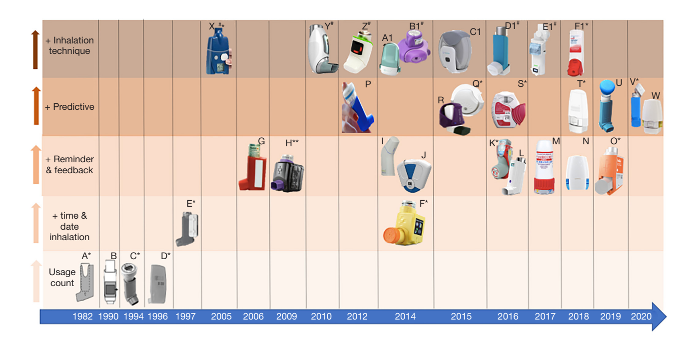
Figure 2 The evolution of smart inhalers over time. (A) Nebulizer Chronolog (68); (B) Aerosol Actuation Counter (MDI) (69); (C) Doser (MDI) (70,71); (D) Smart Mist (MDI) (69,72); (E) MDILog (MDI) (69,73); (F) SmartTouch for Symbicort (MDI) (69,70); (G) SmartThaler Tracker (pMDI) (69); (H) SmartTrack (MDI) (69,74); (I) Inspiromatic (DPI) (75); (J) Prohaler (DPI) (76); (K) Updated SmartTouch for Symbicort (MDI) (77-79); (L) eMDI (pMDI) (80); (M) Turbu+ (MDI) (81); (N) Electronic Breezhaler (DPI) (82); (O) Hailie for Flovent, available for multiple devices (Ventolin, ProAir, Seretide) (MDI) (83,84); (P) CareTRx (MDI) (69,85); (Q) Propeller sensor Diskus (DPI) (86,87); (R) HeroTracker (DPI & MDI) (88); (S) GSK Elipta inhaler (propeller sensor) (DPI) (89,90); (T) Propeller sensor for Neohaler (and Breezhaler) (DPI) (91,92); (U) Findair (MDI) (93); (V) Propeller sensor for Symbicort (pMDI) (94); (W) Enerzair Breezhaler (DPI) (95); (X) I-neb (Nebulizer) (96,97); (Y) Verihaler (MDI) (98); (Z) T-haler (MDI) (99); (A1) RSO1 (DPI) (100); (B1) INCA (DPI) (101); (C1) Respiro Sense diskus (DPI), also available for Easyhaler, Zephir, Handihaler and Elipta (102); (D1) Inspair (pMDI) (103); (E1) Pneumahaler (Soft mist inhaler) (104); (F1) Proair Digihaler (mDPI) (105). *, FDA approved smart inhalers; **, Smartdisk (DPI), Smartturbo (DPI), Smartflow (pMDI), Smarttura (SMI) are devices from the same company but not FDA approved. They all have reminder and feedback function and count the number of inhalation and record time and date, but they are suited for different inhaler devices. This company is now Hailie; #, do predict exacerbations and does not give reminders.

variability in adherence levels of participants can have a significant impact on the required samples size and trial power, and thus costs of the trial (106). Approximately 63% of the randomized controlled trials examining treatment for patients with severe asthma did not report whether the participants were adherent. Trials examining adherence achieved a significantly higher power (mean power 59%) to find expected differences in the forced expiratory volume within one second (FEV<sub>1</sub>) compared with trials that did not examine adherence (mean power 49%). Of note, the adherence-examining trials had a lower sample size. It has been suggested that undetected non-adherence is responsible for up to 50% of the variance in FEV<sub>1</sub> results (107).