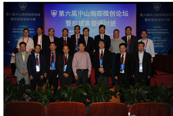
Figure 1 Group photo of experts.