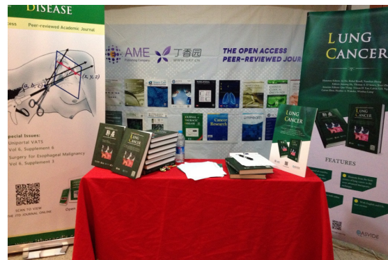
Figure 2 Booth of AME Publishing Company with its new book Lung Cancer .