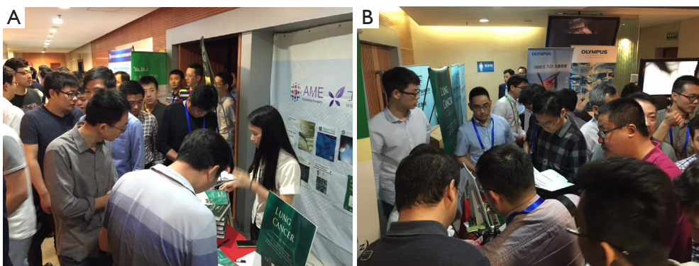
Figure 3 Lung cancer is well received with readers.