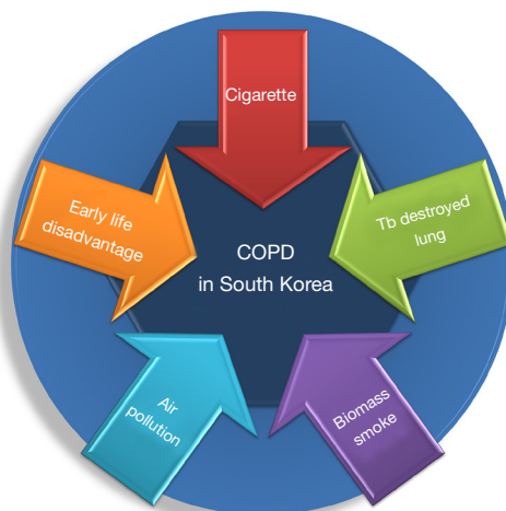
Figure 1 Potential causes of the high prevalence of COPD in South Korea. COPD, chronic obstructive pulmonary disease.

the early diagnosis rate of high-risk COPD patients and improve COPD awareness (15). The study was conducted in males aged over 40 years who were current smokers at enrollment. Handheld spirometry was performed; FEV_1/FEV_6 \leq 0.77 was considered abnormal, and 30 (28.6%) of 105 participants showed abnormal spirometry results. The majority of smokers underestimate their risk factors associated with smoking compared with nonsmokers (15). The results of this study imply that many COPD patients in South Korea are undiagnosed. It is essential in primary care clinics to find active cases using spirometry. Reports indicate that underdiagnosis of COPD and low utilization of PFTs is a universal phenomenon in Asian countries, including China, Taiwan, Indonesia, the Philippines, and Thailand (16,17).