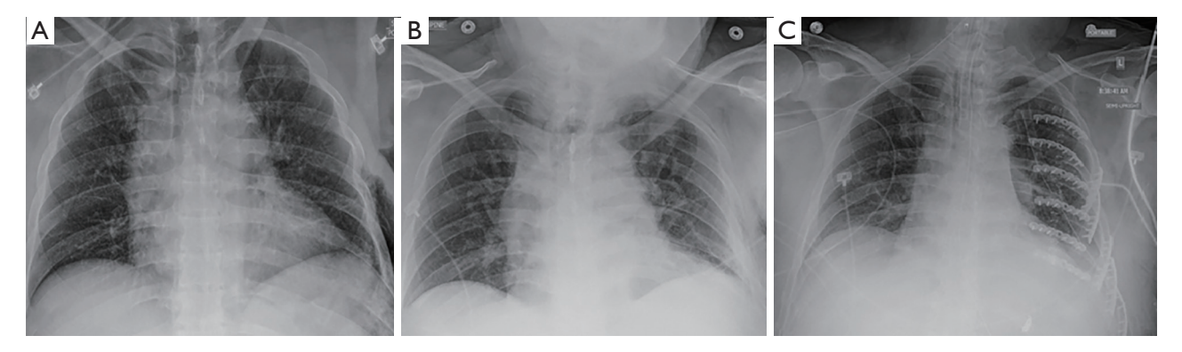
Figure 1 Initial chest radiography (A) of a 55-year-old male who sustained left 4–9 rib fractures which were nondisplaced. Chest radiography of the same patient 24 hours after ICU admission (B) showing interval rib fracture displacement. Chest radiography after SSRF (C) during which this patient received 11 plates to restore chest wall stability. ICU, intensive care unit; SSRF, surgical stabilization of rib fractures.