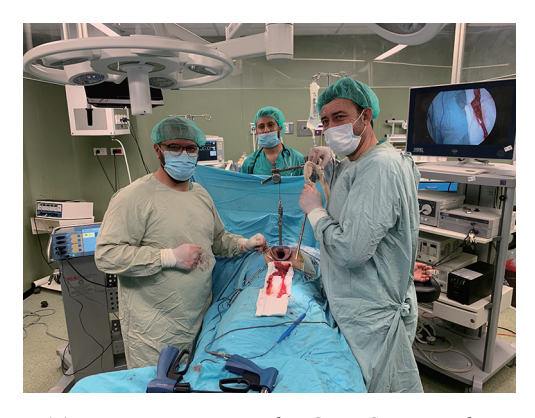
Figure 3 Training surgeons in the Gaza Strip on the uniportal VATS technique. VATS, video-assisted thoracic surgery.

common in Palestine compared to the Western world.