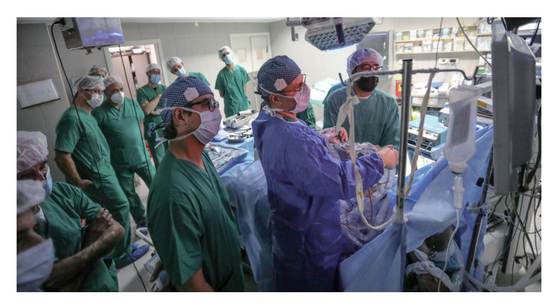
Figure 2 A masterclass in uniportal VATS technique held at Al-Makassed Hospital 2020. VATS, video-assisted thoracic surgery.