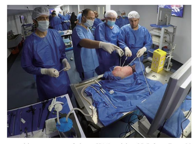
Figure 7 Junior surgeons during wet lab training session; Cadaveric VATS workshop (NTI, Cairo, Egypt. May 2018). VATS, video-assisted thoracic surgery; NTI, National Training Institute. This image is published with the participants' consent.

practice is interesting in Egypt as the cost of chest CT scan was as low as 25$ in private radiology centers, compared to 125$ for PCR, so we notice a high number of self-referrals to get a scan to exclude COVID-19 infection then consult a physician regarding abnormal findings and this has made a significant impact on the number of patients requiring surgery for accidentally discovered lesions but reports of this impact not yet been published. This comes contradictory with reports from several centers in the world that had an established LDCT lung cancer screening program reported that COVID-19 caused significant disruption in lung cancer screening, leading to a decrease in new patients screened and an increased proportion of nodules suspicious for malignancy once screening resumed (75,76).