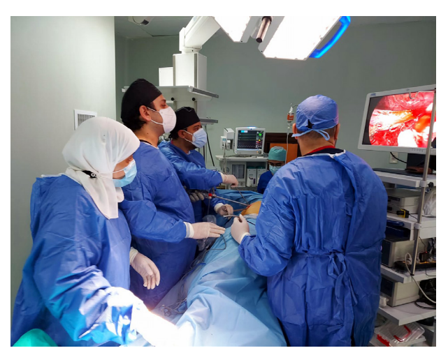
Figure 6 Adoption of new techniques; uniportal VATS (Assiut University Heart Hospital, Assiut, Egypt). VATS, video-assisted thoracic surgery. This image is published with the participants' consent.

By turn, to train other willing thoracic surgeons,