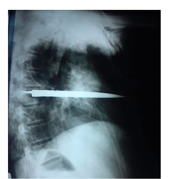
Figure 4 Lateral chest film: showing a whole blade of kitchen knife extending from spine posterior to just retrosternal anteriorly with the inserted chest tube (66).

to remove distally located FB in adults and children (52,56,58,59).