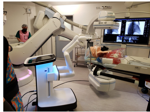
Figure 5 Setup for robotic bronchoscopy in our hybrid operating theatre is shown. The robot consists of two arms holding the bronchoscope in place, which was inserted into the model's airway via an endotracheal tube. An additional metal holder is required to stabilize the entrance of endotracheal tube. The robot is placed at the head side so that CBCT can be performed without obstruction. CBCT, cone-beam computed tomography.