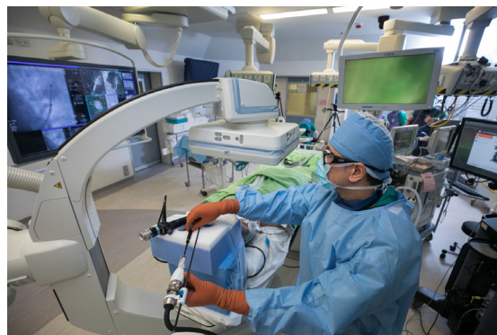
Figure 3 Navigation towards target lesion with ENB and fine real-time adjustments under fluoroscopy guidance. Eventually, position of the bronchoscopic tool was confirmed with CBCT. ENB, electromagnetic navigation bronchoscopy; CBCT, cone-beam computed tomography.

From our experience and those of others, real-time multimodal imaging in HOR increases diagnostic yield