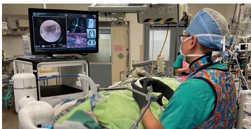
Figure 6 The operator controls the motion of the robotic bronchoscope via a remote controller. On the monitor screen of the console, real-time endobronchial view is shown on the left while virtual bronchoscopy view was shown on the right.

procedure for small peripherally located nodules which otherwise would be challenging to reach. Naturally, the use of different ablative energies is under ongoing research. Alternative energy sources, for example cryoablation and thermal vapor ablation, each has their own specific ablation zone size and shape, and performance characteristic in the lung parenchyma has shown promising early results (44,45). ENB ablative surgery is still in its infancy and will be an abiding research interest in our locality.