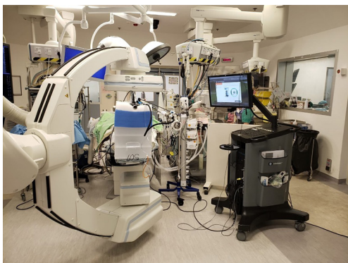
Figure 2 Usual set-up of our HOR using ENB, in combination with intra-operative cone-beam CT. HOR, hybrid operating room; ENB, electromagnetic navigation bronchoscopy; CT, computed tomography.

of Wales Hospital is the utilization of a hybrid operating room with cone-beam CT (CBCT) and fluoroscopy, which is magnetic and radiation compatible, to perform percutaneous hook-wire localization of small subsolid lung nodules followed by uniportal VATS resection in the same session (31) ( Figure 2 ). This stream-lined workflow by avoiding the delay between localization and surgery improved patient experience and reduced complications such as pneumothorax and hookwire dislodgement, when compared with the conventional arrangement of hook-wire insertion in the radiology department and subsequent transfer to the operating room (32).