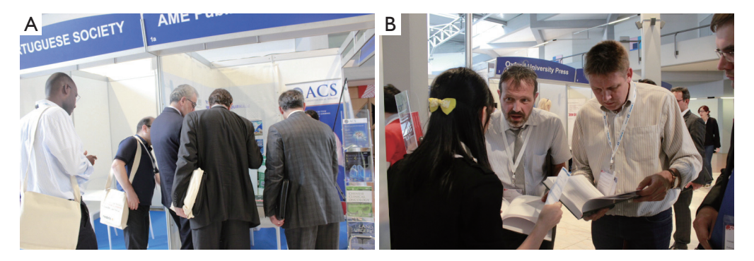
Figure 7 At the AME Exhibit Booth during the ESTS conference, attendees were interested in and consulting about the journals and books published by AME Publishing Company.