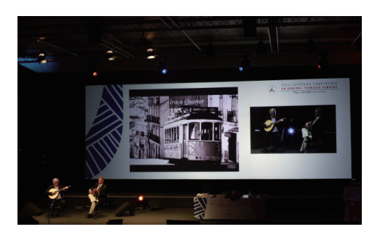
Figure 1 The Opening Ceremony of the 23<sup>rd</sup> Annual Congress of European Society of Thoracic Surgery (ESTS) began with traditional Portuguese Fado, which is a symbol of Portugal and has been declared part of the Intangible Cultural Heritage of Humanity by UNESCO.

The Postgraduate Symposium was held on May 31, a day before the opening ceremony of the 23<sup>rd</sup> European Conference on General Thoracic Surgery. As per the rules of the Postgraduate Symposium, three teams respectively from Europe, The Americas and Asia would contest for the Masters Cup via a question-and-answer form in four sessions. Each team had 6 trainee members and 6 senior