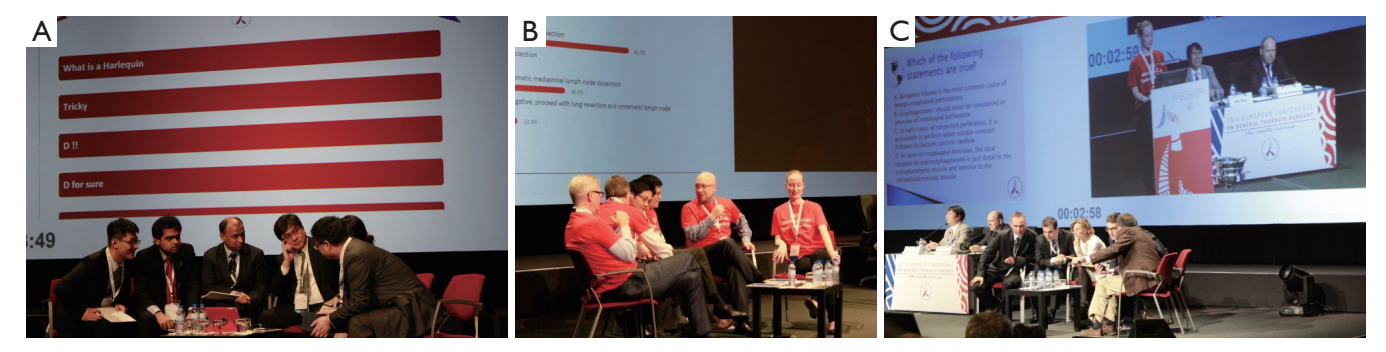
Figure 2 At the 2015 ESTS Postgraduate Symposium, team members were thinking and discussing about a challenging case question. (A) Asian Team; (B) American Team; (C) European Team.