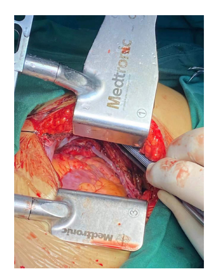
Figure 2 Two proximal anastomoses on the aorta.