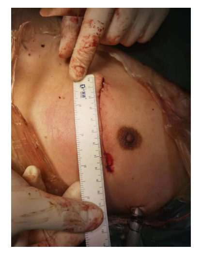
Figure 4 Length of the incision.