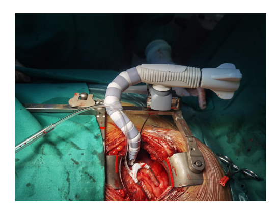
Figure 3 Distal anastomosis.

intramyocardial vessels were also difficult for a surgeon in the learning curve for MICS CABG.