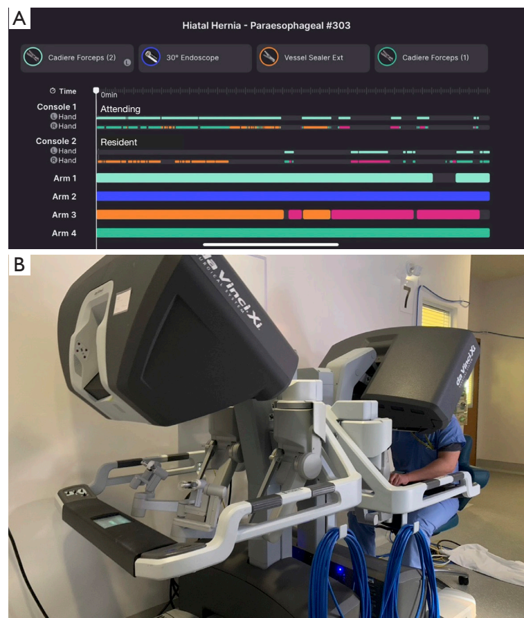
Figure 2 Image of the instrument used by the attending and the resident during paraesophageal hernia repair (A). Photo of Da Vinci Xi dual console with a resident in the second console (B).

first robot-assisted hiatal hernia repair. All residents who performed the first robot-assisted hiatal hernia repair were chief residents. During the 13 months before implementing the video-based curriculum, the residents spent 11% of the time controlling the robot during the case. After the implementation of the program, the resident spent significantly more time controlling the robot (48%, P < 0.0001 , Figure 3 ).