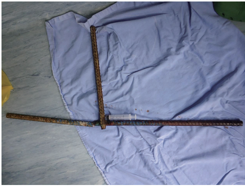
Figure 5 The exposed L-shaped metallic bar on the head side was cut off carefully and the remaining straight metallic bar measured about 40 centimeters.