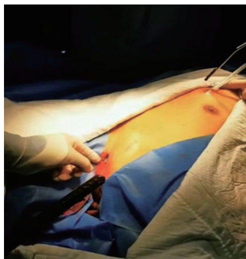
Figure 4 A 26-F chest tube was inserted through the fifth right intercostal wound.

All procedures performed in this study were in accordance with the ethical standards of the institutional and/or national research committee(s) and with the Declaration of Helsinki (as revised in 2013). Written