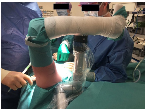
Figure 3 Trimano arm holder (Arthrex, Naples, FL, USA).

persistent NTOS (27,28). A TA approach enables a perfect exposition to perform a tenectomy of 3–5 cm of the pectoral minor muscle without the need for a separate incision.