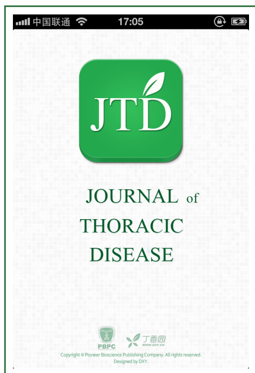
Figure 1. Display of the start page.

Are you up to your neck in daily clinical practices? Then you may need up-to-date information available when and where you want it, and delivered in an easy-to-use format. Starting from January 2013, Journal of Thoracic Disease, published by the Pioneer Bioscience Publishing Company ( http://www.thebpbc.org/ ), offers a mobile edition developed by the technical team of DXY ( www.dxy.com ) and is downloadable by searching ‘JTD’ in App Store ( https://itunes.apple.com/en/app/jtd/id590415083?mt=8 ), to help you make the most of your time, even on the go (Figure 1).