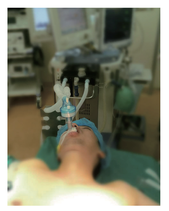
Figure 1 Patient was positioned supine to the right side on the table with both arms abducted approximately 70° from the chest wall. The LMA was placed and attached to the anesthetic circuit. LMA, laryngeal mask airway.

Journal of Thoracic Disease, Vol 8, No 8 August 2016