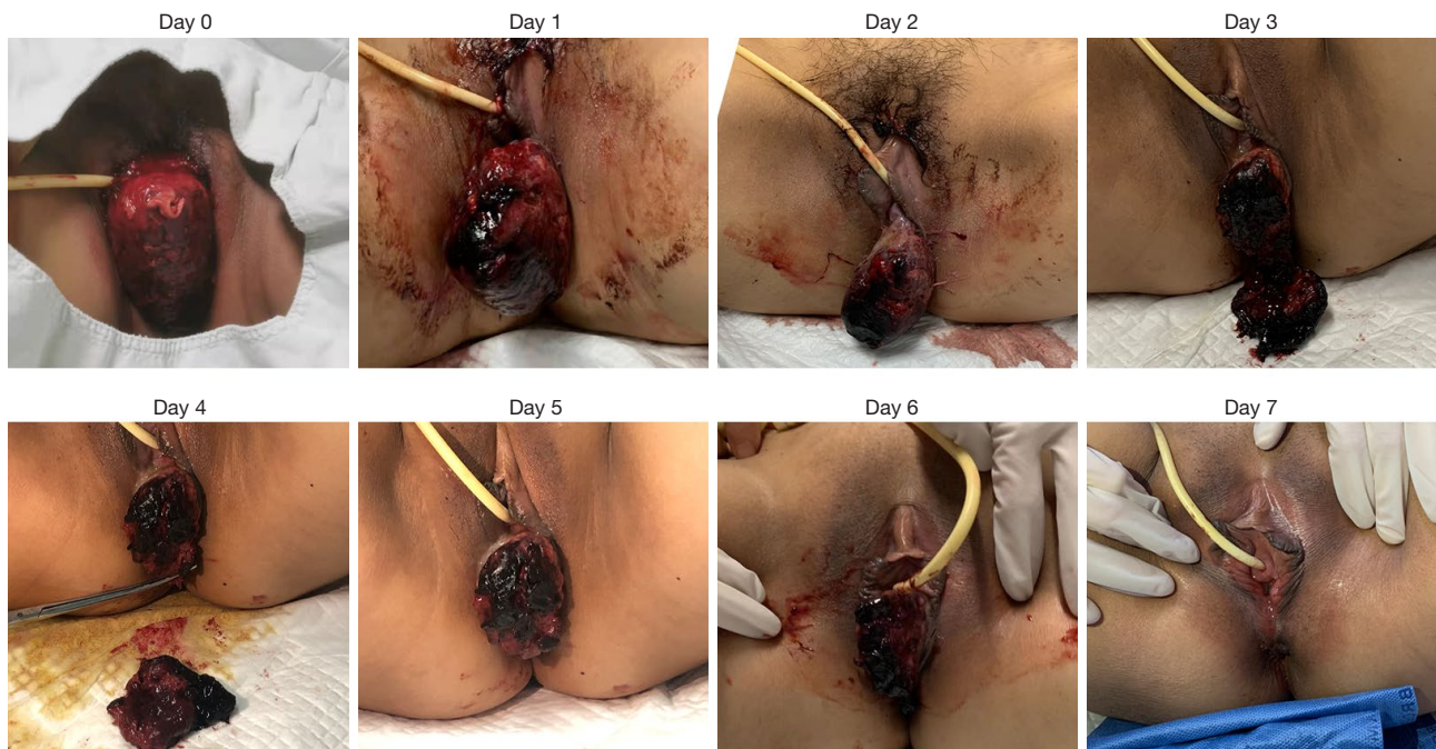
Figure 2 The tumor gradually regressed and it retracted into the vagina by itself on the 7th day after three-dimensional implant brachytherapy.

uterus is usually accompanied by cystocele–rectocele, and if radiation is performed, the damage to normal tissues and organs might be increased. Therefore, radiation therapy is generally not the first choice.