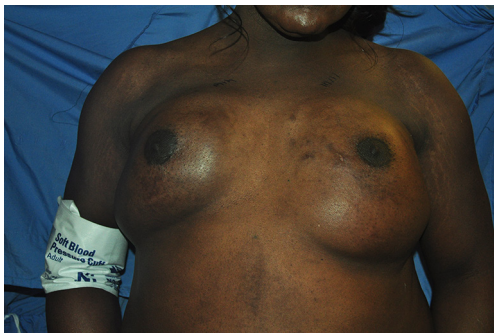
Figure 1 A pre-operative photo displaying nonuniform breast size bilaterally as well as subcutaneous masses visible upon physical examination.

The purpose of this case report is to not only highlight the uniqueness of this scenario but also to serve as a message regarding the necessity of thinking outside of the normal mindset physicians develop through their care of patients that adhere to the traditional gender binary. Therefore, we present the following case report in accordance with the CARE reporting checklist (available at https://tbc.amegroups.com/article/view/10.21037/tbcr-22-25/rc ).