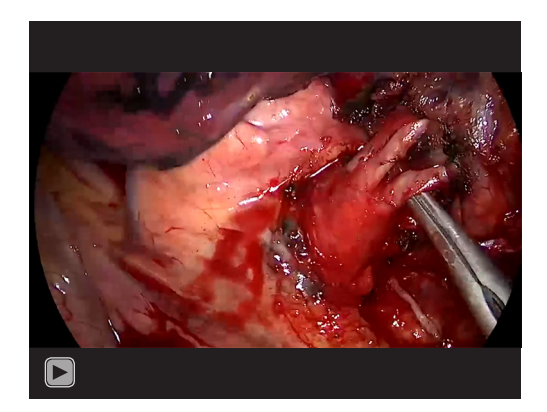
Video 1 Uniportal VATS sleeve lobectomy for left upper lobe. VATS, video-assisted thoracoscopic surgery.

was defined as death from any cause within 30 days after surgery. Prolonged air leakage was defined as lasting for more than 7 days after surgery. Postoperative complications were evaluated using the Common Terminology Criteria for Adverse Events (version 5.0).