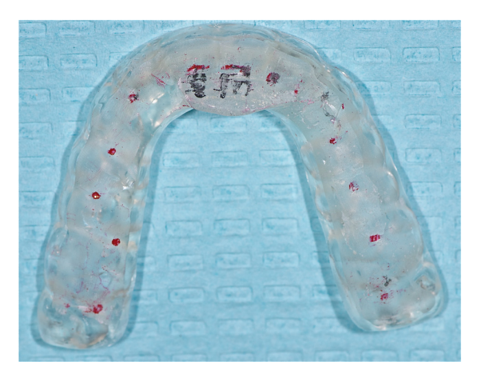
Figure 3 Maxillary anterior repositioning appliances ARA. This is a maxillary ARA adjusted to even bilateral contact with the patient in a protrusive position. The ramp in the anterior is added and retroclined to hold the patient in this position. There is some freedom of movement. It is important that the patient have good posterior support and even contact to minimize any trauma to the mandibular anterior teeth. ARA, anterior repositioning appliance.

proponents of ACs feel that the canines should be included because of their particular proprioceptive qualities with no incisal or posterior contact (37). To date, most studies show no additional benefit in comparing ACs with FPs. Furthermore, headache studies have shown that there was minimal effect in improvement of migraine headaches using ACs when compared to low dose tricyclic antidepressant medication (38). There have been both one MAUDE database report and anecdotal evidence to indicate that these appliances even worn just at night can cause occlusal changes with resulting anterior open bite. However, here have been no formal studies on this ( Figure 4 ).