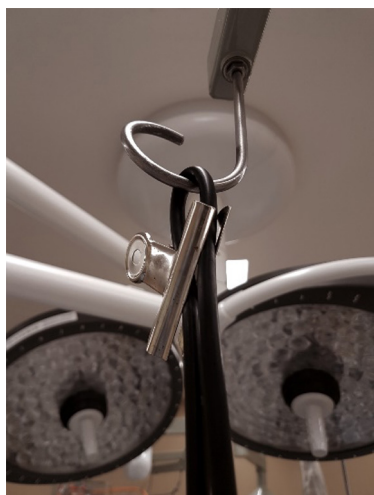
Figure 2 The fibreoptic nasendoscope is fastened in place with a firm holding clip. Alternatively, cable ties can be used.

anaesthesia of the nasal cavity and larynx. A flexible fibreoptic nasendoscope is then positioned in place with optimal view of the larynx and vocal cords, and suspended about an overhanging hook and fastened securely with a firm holding clip ( Figures 1,2 ), or even a cable tie so as to not allow for accidental release from its suspended position and avoid harm to the patient. The nasendoscope should be suspended at a height just above the supraglottis, avoiding