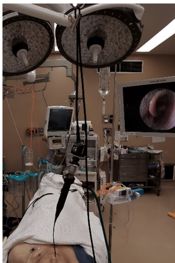
Figure 1 Suspended endoscopy technique setup. A flexible fibreoptic nasendoscope is positioned and suspended about an overhanging hook.