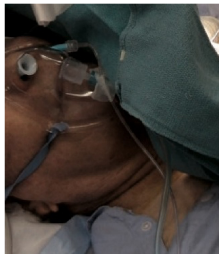
Figure 3 Hudson mask with window and nasopharyngeal airway in situ which provides a comfortable passageway for nasendoscope placement.

anaesthesia of the nasal cavity and larynx. A flexible fibreoptic nasendoscope is then positioned in place with optimal view of the larynx and vocal cords, and suspended about an overhanging hook and fastened securely with a firm holding clip ( Figures 1,2 ), or even a cable tie so as to not allow for accidental release from its suspended position and avoid harm to the patient. The nasendoscope should be suspended at a height just above the supraglottis, avoiding