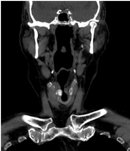
Figure 5 Coronal slice non-contrast CT scan demonstrating Gore-Tex implant in situ with optimal medialisation of right vocal cord.