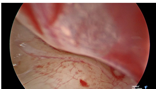
Figure 1 This is an intraoperative image of the tympanic nerve seen during an endoscopic tympanic neurectomy. Using a 30- and 45-degree angled endoscope, it is possible to visualize the entire course of the tympanic nerve.