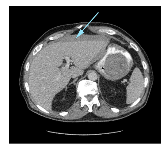
Figure 1 Axial CT scan showing a solid organ injury (subcapsular haematoma of the liver) illustrated by intraperitoneal blood predominantly around left lobe of the liver (arrow). No specific hepatic laceration can be seen.

Success rate of insertion of PEG tubes by an OLN-HN surgeon in this study (100%), had similar outcomes