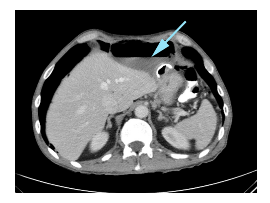
Figure 2 Axial CT scan showing a collection of fluid/gas (5.8×9.8×5.9 cm) consistent with an intraabdominal abscess (arrow) and moderate pneumoperitoneum.

Figure 1 Axial CT scan showing a solid organ injury (subcapsular haematoma of the liver) illustrated by intraperitoneal blood predominantly around left lobe of the liver (arrow). No specific hepatic laceration can be seen.