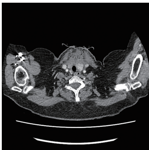
Figure 3 Wound and superior mediastinal collection with gas locules visible at the CT scan. CT, computed tomography.

underestimated and be treated as an acute mediastinitis. A CT scan will be a paramount test to identify the extent of the infection. The surgical approach to treat the infection can vary from a wound re-exploration with irrigation and drainage utilising the original surgical wound if the infection has been recognised early and the CT scan confirms only supero-anterior mediastinum collection, to a bilateral VATS mediastinal and chest cavities drainage.