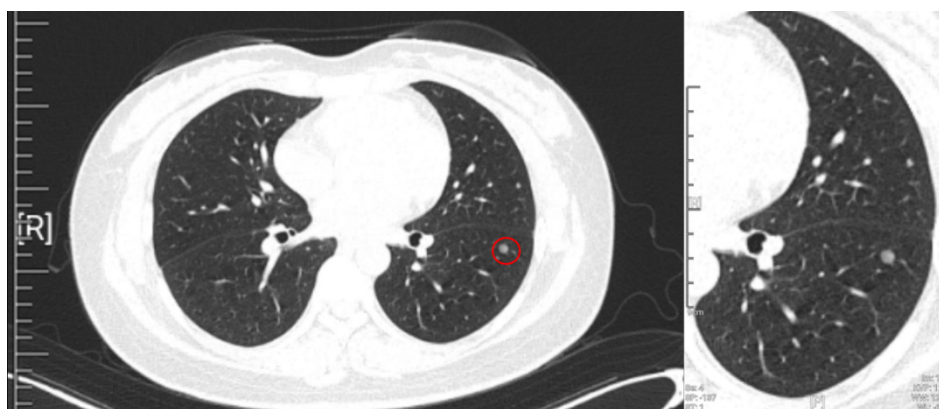
Figure 1 The CT images of the nodule (red circle) in the left lower lobe. CT, computed tomography.