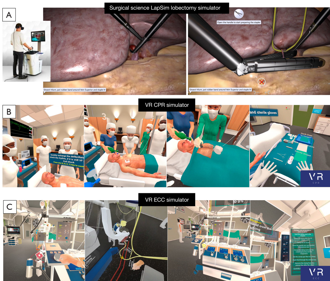
Figure 1 Stills from the LapSim VATS simulator (27) (A), the VR CPR simulator (33) (B), and VR ECC simulator (31) (C). VR, virtual reality; CPR, cardiopulmonary resuscitation; ECC, extracorporeal circulation; VATS, video-assisted thoracoscopic surgery.

discriminate between all three groups on the basis of blood loss and time taken. The most recent published assessment of competency study using the LapSim simulator found that the VR simulation consistently rated participants with high interrater reliability scores, and that it could provide a validated pass/fail threshold for users (36). These thresholds, termed the Copenhagen test, were based on time, blood loss, and instrument path length for each intervention. This simulator therefore fulfils all the criteria of de Visser as outlined above, and represents the first validated VR surgical simulator in the cardiothoracic field to do so.