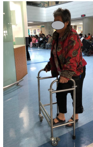
Figure 14 Outpatient visit—walking assistance.

proper support, ensures clinic visit safety, lowers the risk of falls out of losing balance, and recognizes the practicability of switching to use the dining table (Figure 12), convenience table (Figure 13) and walking assistance (Figure 14). Elderly patients suffer from a worsening sense of balance and reaction due to their weakening bodily functions. “The Three-in-One Assistive Technologies for Seniors—Support, Move, Table” enhances the safety measures of clinic equipment, builds up trust in and satisfaction with clinic safety, thereby creating a friendly, safe clinic environment.