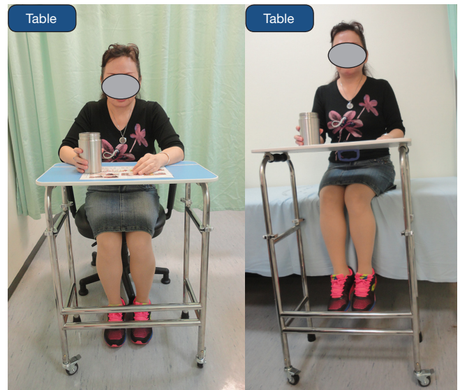
Figure 11 Convenience tables.

and instability. Besides, during their hospital visits, elderly patients often have to stand on the body weight scale for measurement; when these elderly patients are on and off the scale, it is often more time-consuming and labor-taking for them than younger patients do, even at the risk of frequent falls during the process. Based on this, the motivation for innovation arises, in the hope of offering elderly patients