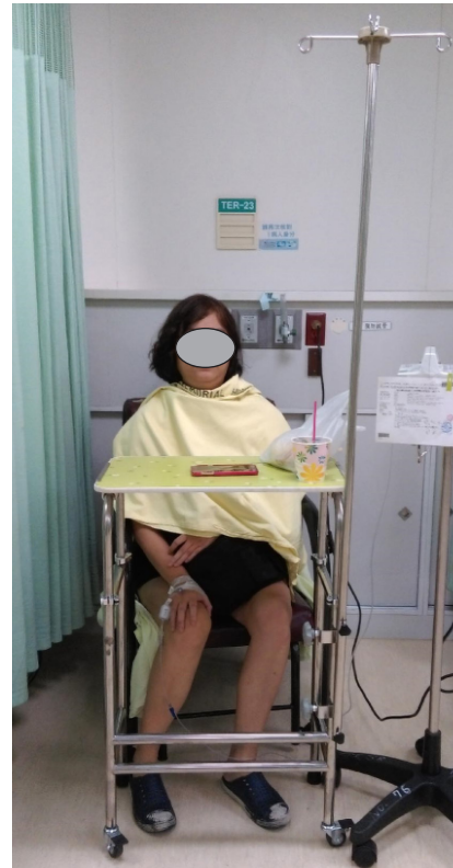
Figure 13 Outpatient injection room—convenience tables.

For those elderly patients on the examination bed,