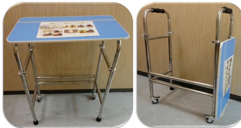
Figure 3 New-project products.

In the aging society, it is necessary and required to have safety grab rails anytime and anywhere. This innovative