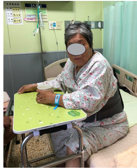
Figure 16 Ward—dining tables.

Ethical Statement: The authors are accountable for all aspects of the work in ensuring that questions related to the accuracy or integrity of any part of the work are appropriately investigated and resolved. The study was conducted in accordance with the Declaration of Helsinki (as