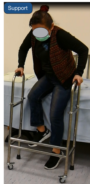
Figure 6 Off-bed grab rails.