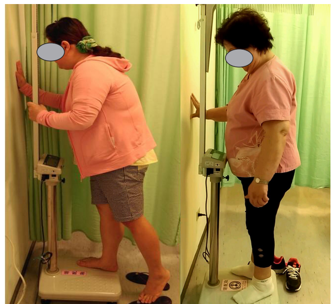
Figure 1 Usage of body weight.

Support the physical activity of geriatric patients is relatively slow, unstable and weak, so the medical personnel must ensure their safety to protect them from falling down. The status quo is as follows: body weight scales without grab rails put patients in an unsteady state on and off the scale ( Figure 1 ); the chair grab rails fail to offer