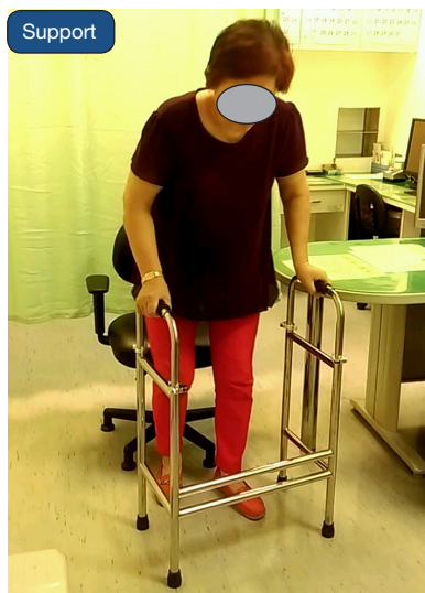
Figure 5 Table and chair grab.