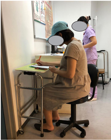
Figure 15 Outpatient visit—writing desks.