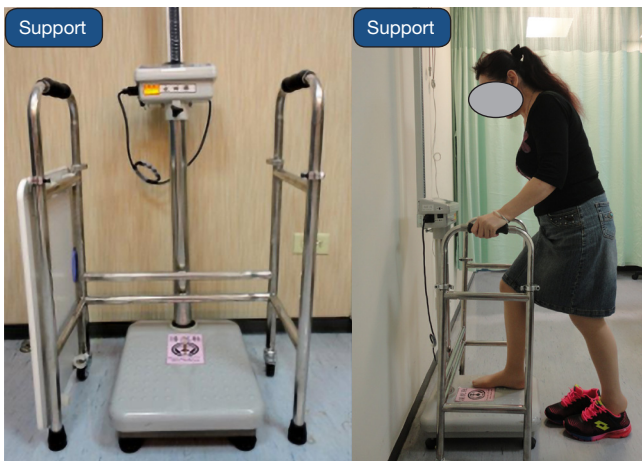
Figure 4 Body weight scale grab rails.