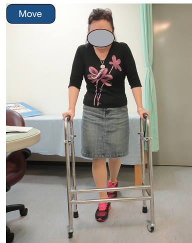
Figure 10 Mobility aids.