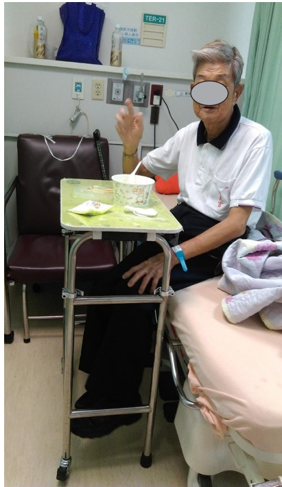
Figure 12 Outpatient injection room—dining on bed.

handy supportive devices to reduce the rate of falls and consequent harm, creating a better care environment.