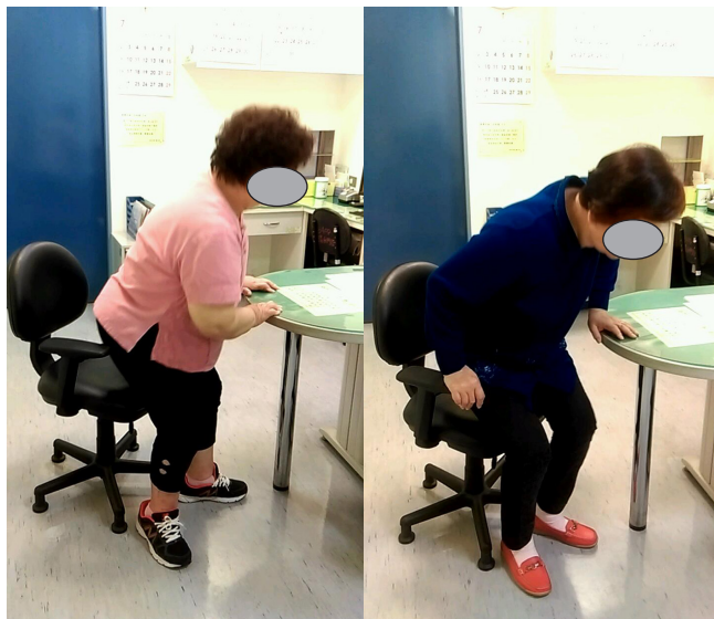
Figure 2 Standing up from chairs.

We offer the “supportive = assistive” technologies senior citizens need in order to improve the safety of medical visiting, the quality of medical caring, and the satisfaction with environmental security. The Three-in-One Assistive