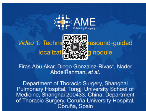
Figure 4 Technique of ultrasound-guided localization of lung nodule (37).

Available online: http://www.asvide.com/article/view/24683