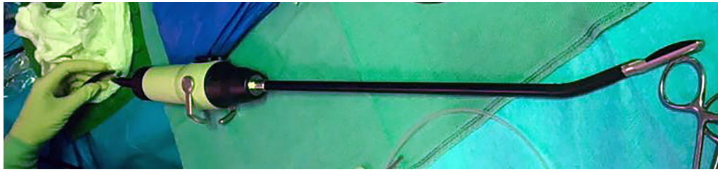
Figure 2 Endoscopic ultrasound probe.