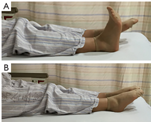
Figure 1 Ankle pump exercises.

Patients should be encouraged to cough to discharge inhaled fluid. Use a fiberoptic if needed.