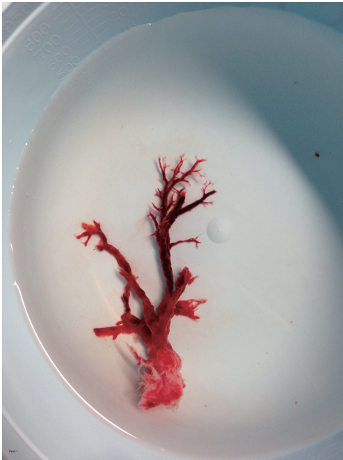
Figure 3 Tracheobronchial cast in a case of massive hemoptysis.

Cryotherapy has also successfully been used to facilitate removal of foreign bodies via flexible bronchoscopy in children younger than 40 months of age (22,23). Although a 1.9 mm cryoprobe is too large to fit down a pediatric bronchoscope's 1.2 mm working channel, a new hybrid bronchoscope from Olympus (BF-MP 160) combines a pediatric 4.0 mm outer diameter with an adult size 2.0 mm working channel that accommodates cryoprobe and most adult size flexible tools used for foreign body extraction. Most authors recommend shortening freezing time to 2–4 seconds in pediatric population to avoid trauma to nearby tissues. Although cryotherapy through a flexible bronchoscope and LMA has been shown to be an effective technique in foreign body removal in the pediatric population, it is not currently the standard of care and further studies are required on safety and efficacy of such approach.