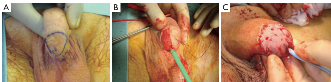
Figure 1 A step-by-step guide for glans resurfacing. (A) In glans resurfacing, the glans quadrant of interest is first demarcated; (B) the epithelium and subepithelium of the quadrant of interest are carefully removed from the corpus spongiosum; (C) split thickness skin graft is used to cover the defect (40).