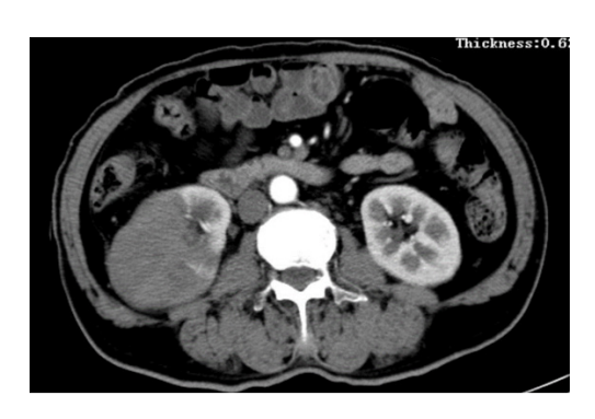
Figure 1 A contrast-enhanced CT finding at the disease onset shows a huge mass (8.5×6.8 cm in diameter) of the right kidney.

sedimentation rate, 32.00 mm/h (reference range, 0–15 mm/h); leukocyte count, 5.07\times10^9 /L (reference range, 3.50\times10^9 – 9.50\times10^9 /L); erythrocyte count, 3.85\times10^{12} /L (reference range, 4.30\times10^{12} – 5.80\times10^{12} /L); hemoglobin level, 112 g/L (reference range, 130–175 g/L). Routine urine and stool tests were normal.