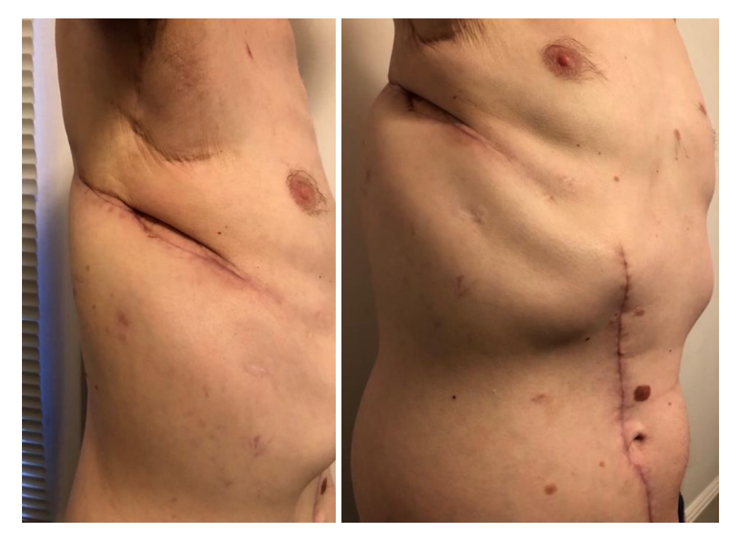
Figure 3 VRAM free flap repair incisions 3 months post-operatively. VRAM, vertical rectus abdominis myocutaneous.

imaging ( Figure 2 ), whereby a right pigtail pleural chest tube was placed on POD 13 remained in place for 39 days until his subcutaneous emphysema completely resolved. The patient's respiratory status and activity levels improved considerably post-operatively. He still requires low-dose oxygen therapy at home but is able to trial off supplemental oxygen for several hours at a time, which he could not do previously. He has also increased his activities at home and pursues mild-effort activities outside his home. Additionally, he has resumed adjuvant chemotherapy